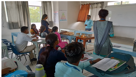
Simulating a real classroom - Student Practice